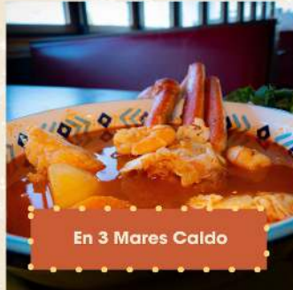
En 3 Mares Caldo