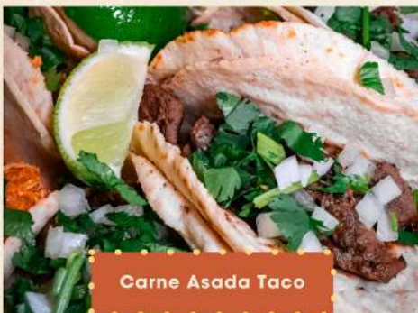
Carne Asada Taco